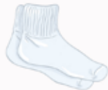
White Ankle Socks