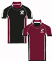
Reversible Rugby Shirt